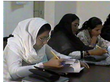
Women Councilors Hyderabad

It was organized on 13 April 2002 at Hyderabad in collaboration with Sindh Development Society. The Participants represented various segments of the society and included professionals like Computer composers & engineer, Journalists, social worker, Lawyers,