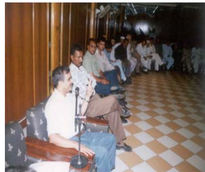
Deputy secretary local government Punjab

After these suggestions, Deputy secretary local government Punjab was invited for his reflection. Deputy secretary local government briefly said first of all I would like to correct every one that, local government commission is in place and 4 members have also been selected who held their first meeting. But, participants were not aware about this who were primarily