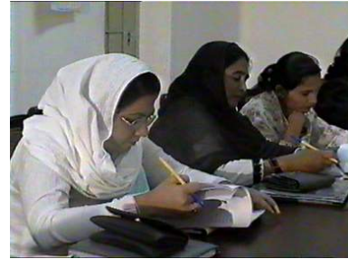
Women Councilors Hyderabad

It was organized on 13 April 2002 at Hyderabad in collaboration with Sindh Development Society. The Participants represented various segments of the society and included professionals like Computer composers & engineer, Journalists, social worker, Lawyers,