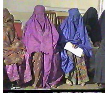
The picture speaks for itself Women Councilors-Zob

UCs offices are in Hujras & Parks: It is nearly impossible for female councilors to join UCs meetings as UC offices are in Hujras and in parks. They have hardly invited for monthly meeting and it is not easy for labor or peasant councilor to join such meetings (as shared by labor female councilor, whenever she participates in meeting, factory owner cuts her wages).