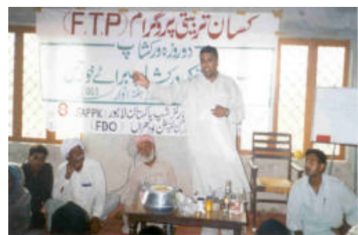
Practical Training Workshop (Lodharan)

Practical Training Workshops: With the objective of providing practical exposure to pertinent farming techniques and issues, these workshops were held throughout the program in varying lengths of duration ranging from one to four days. Relevant resource people from concerned line departments, research institutes and agricultural