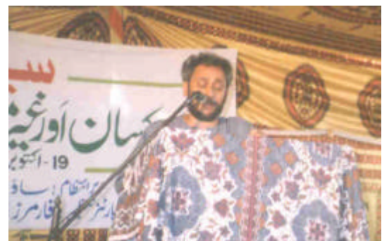
Seminar on Cotton Pricing

Seminars: Issue based seminars were held in both provinces to address issues of local concerns. These seminars provided a platform for broader participation and the list of participants often included a greater number of farmers, female growers, besides line department representatives and media personnel who had specifically been invited to draw greater public attention to the issue at hand as well as give coverage to the organized event. One such seminar held in Sindh concerned local level agricultural marketing issues and their solutions implying increased farmers' awareness and enhanced capabilities to deal with organizational problems. A representative of local farmers in the