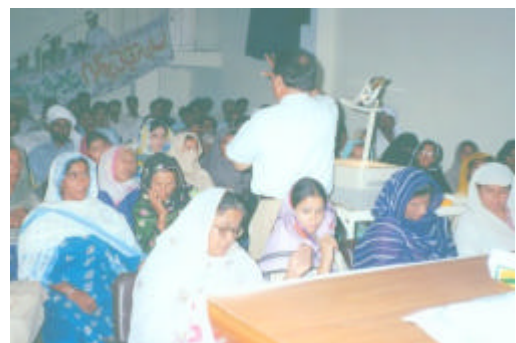
Exposure Visit to BM-Technology Training Institute Faisalabad

Hari/kissan committee members were selected by their concerned Tehsil Resource Organizations for participation in exposure visits to agricultural research institutes including those based in the Agricultural Universities in Faisalabad and Tando Jam. In Punjab, 64 farmers from 9 tehsils were sent to Punjab Seed Corporation Research Centre at Peeruwal. Here, these farmers learned of pre-basic, basic and certified seeds and were informed about issues concerning procurement, processing, storage and marketing of seeds. After the exposure visit, Punjab Seed Corporation Peeruwal (12 Kilometers from Khanewal) is providing unrestricted access to farmers in the area to certified seeds. Prior to this, the PSC would provide basic and pre-basic seeds only to influential landlords only rather than poor farmers. Additionally, they observed results of different wheat varieties and crop rotations. Pakistan Television also interviewed one of participants of an exposure visit and broadcast his interview about learning how to cultivate mushroom and participating in a practical session on Bio-Aab Technology.