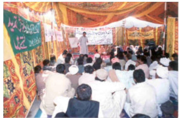
Farmers Education Workshop (Khanewal)

In it, experts were invited to speak on issues of larger consequence including WTO policies and TRIPS/TRIM Agreements so that farmers could become more aware of relevant issues at stake. For example, participants were informed about how tariff reductions being propagated by WTO will favor the more competitive developed